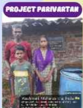
SELF CARE- IQAC